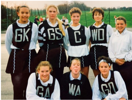
Playing for Comets 1990 [GD bib]