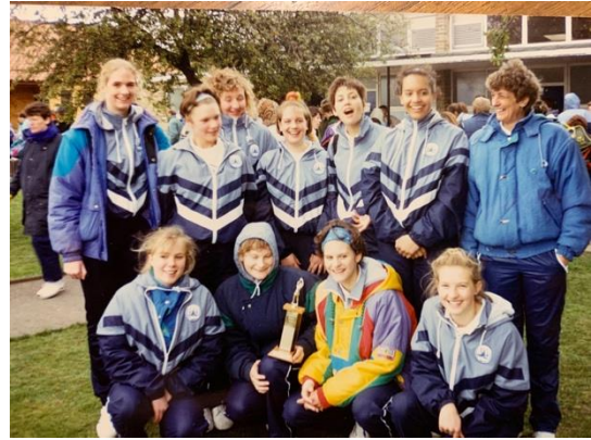
Kent U18 1991 [bright jacket!]