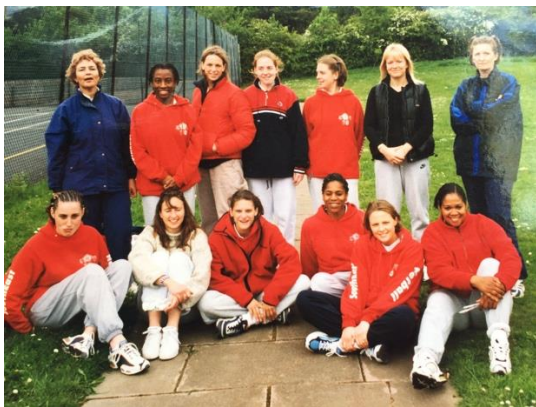
London & SE Regional Squad 1999 [front row, third from left]