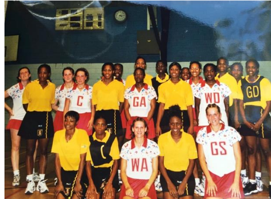
Kent Club v Jamaica