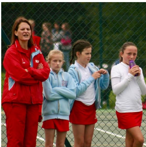
Favourite place = coaching!