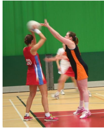
Playing for Kent Club