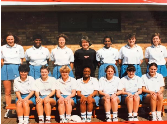
Kent Senior Squad 1995-96 [front row, far right]